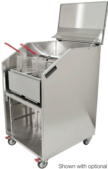
Shown with optional Fryer